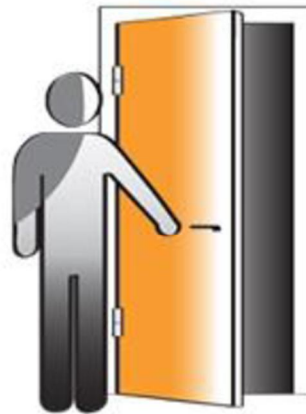
3 = DIN Links