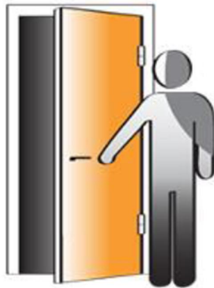
4 = DIN Rechts